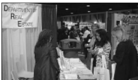
The DRE provided information for consumers, licensees and those interested in real estate careers to the 10,000 participants of the Governor's Conference for Women, held October 11, 2001 in Long Beach.

The school explained its conduct on the basis that students were reluctant to enroll in a resident course requiring mandatory attendance of 45 hours. Whatever the reason, in order to avoid disciplinary action by the Department, a school cannot change an offering without first obtaining DRE approval.